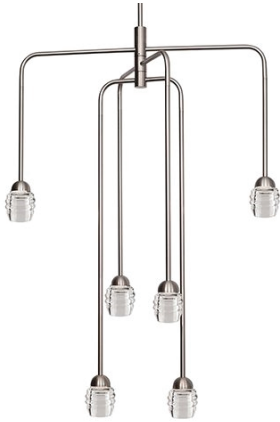
BN - Brushed Nickel